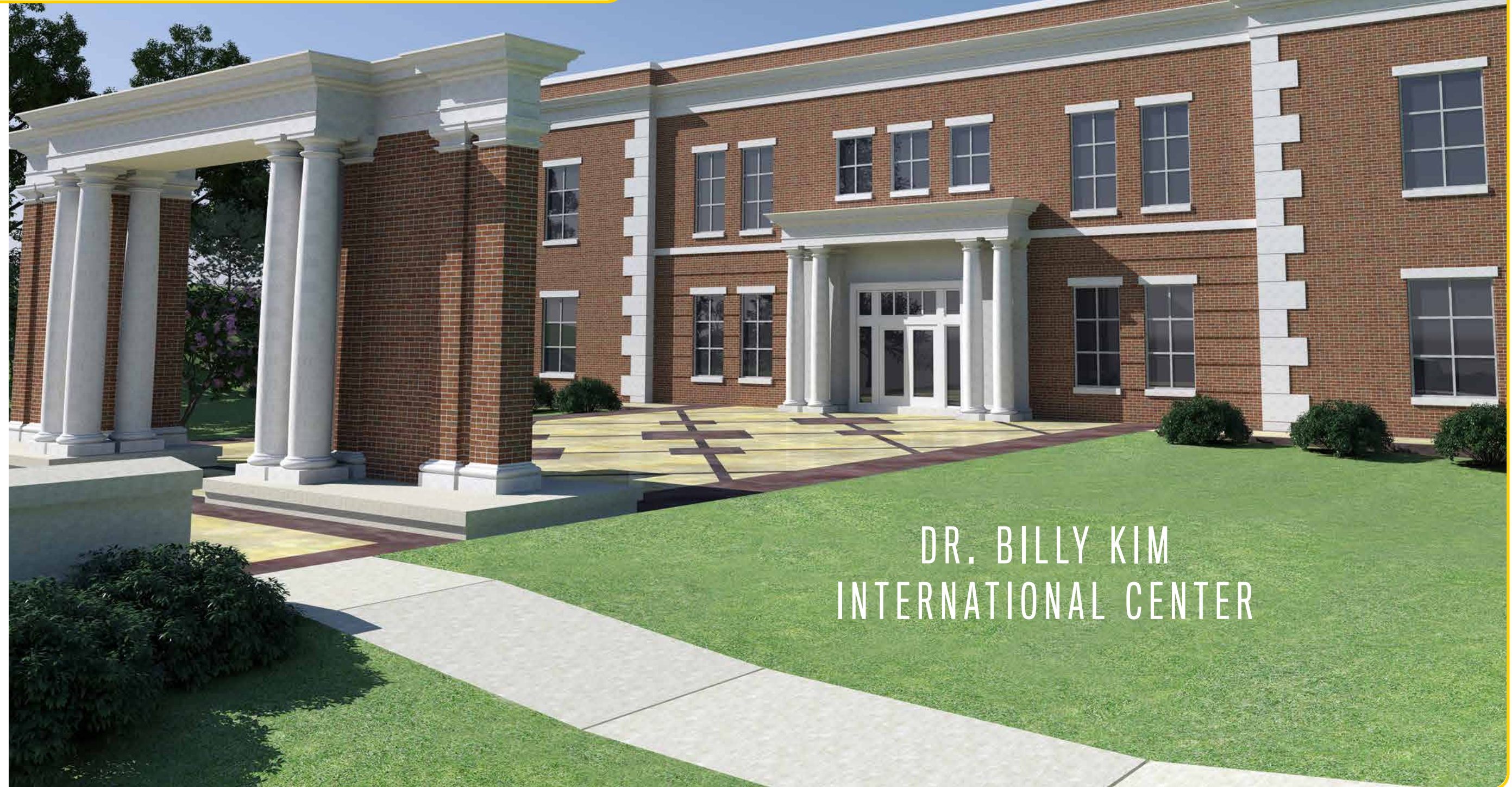
DR. BILLY KIM INTERNATIONAL CENTER